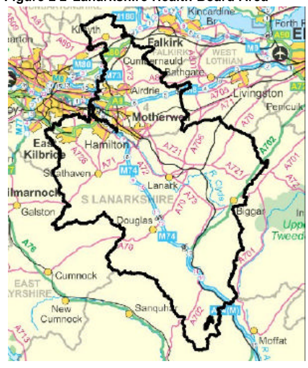
Figure 2-2 Lanarkshire Health Board Area

2.12 Before local government reorganisation (LGR) in 1996, Lanarkshire consisted of five district councils including Clydesdale, East Kilbride, Hamilton, Monklands, and Motherwell, all within the former Strathclyde Region. In 1996, the districts were split into the two councils of North and South Lanarkshire. The Lanarkshire Health Board area has been used for the purpose of comparing Census information since these areas have not been subject to change since 1974. Lanarkshire Health Board area includes the settlements of Airdrie, Clydesdale, Coatbridge, Cumbernauld, East Kilbride, Hamilton/Blantyre, Motherwell, and Wishaw/Newmains/Shotts.