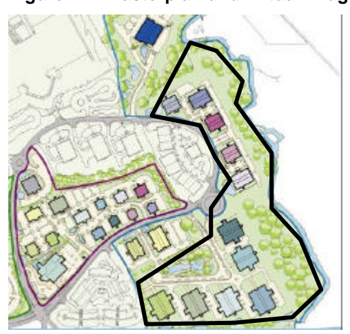
Figure 4-1 Masterplan and virtual image of Strathclyde Business Park